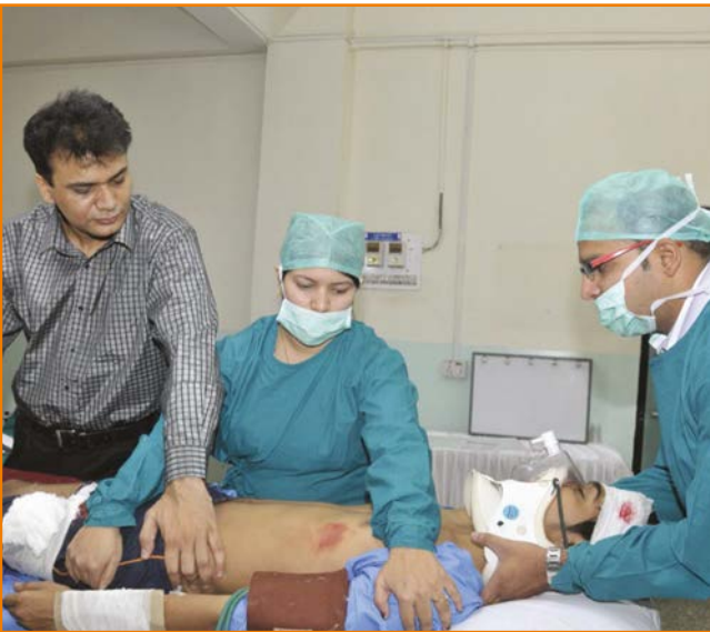
Trauma Simulation at SCHS