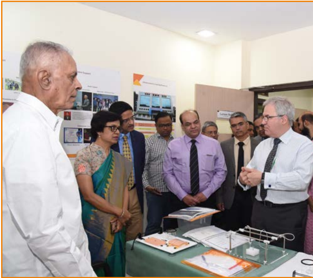
Basic Surgical Skills (BSS) Course of The Royal College of Surgeons, England at SCHS