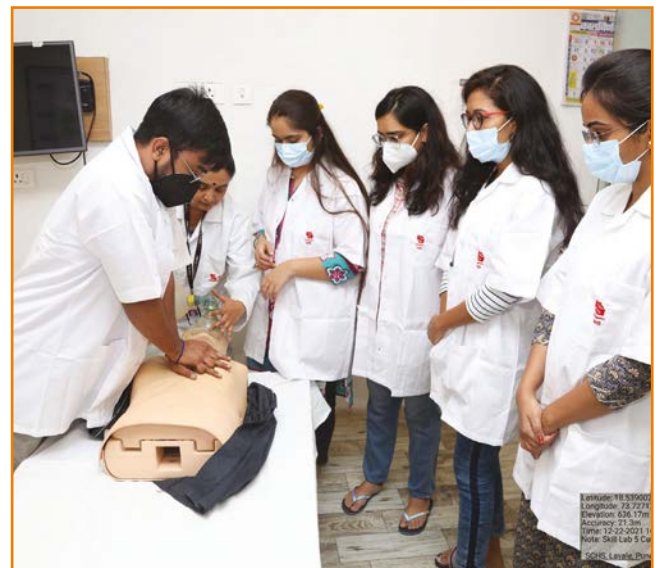
Cardiopulmonary Resuscitation Training at SCHS