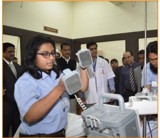
Training on High Fidelity Simulator at SCHS