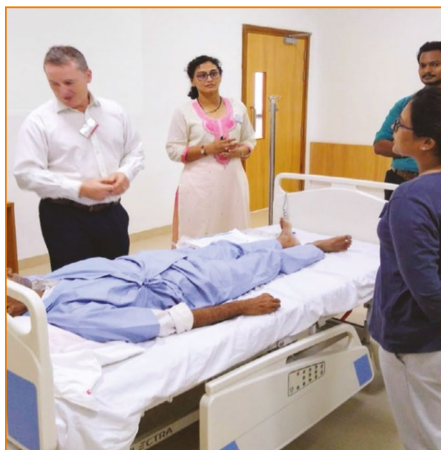
The Art of Debriefing at SCHS