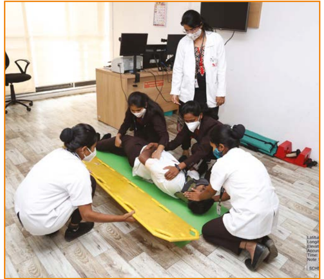
Advanced Trauma Course of International Trauma Life Support (ITLS) Organization, USA at SCHS