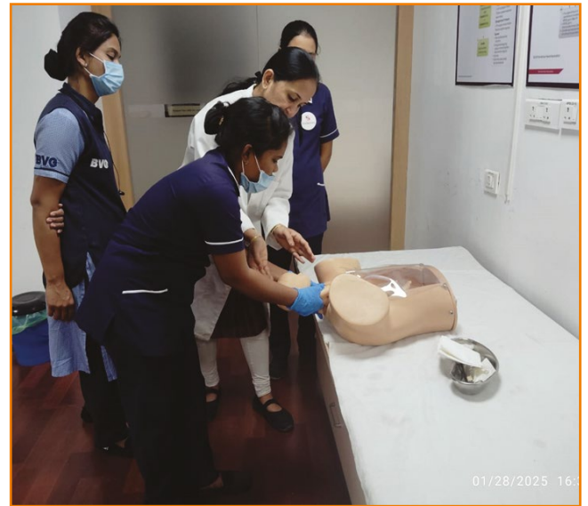
Training of Patient Care Attendants at SCHS