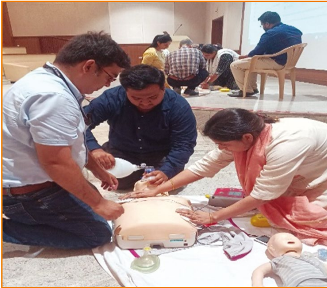
Basic Life Support (BLS) course of American Heart Association (AHA), USA training at SCHS