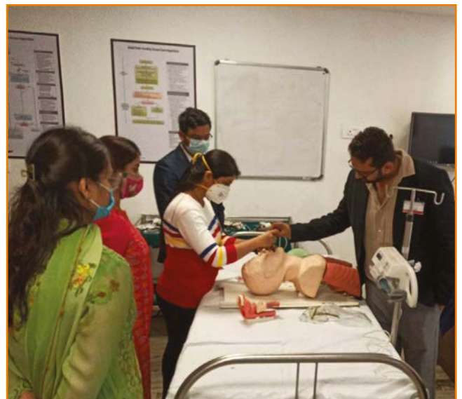
Advanced Trauma Life Support Course at SCHS