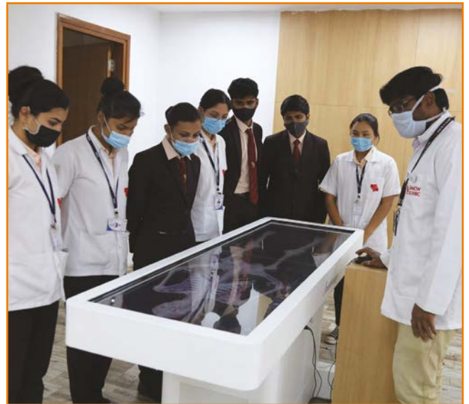
Training on Virtual Dissection Table - Anatmage at SCHS