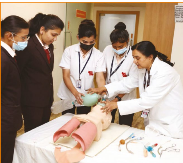
Training on Airway Management at SCHS