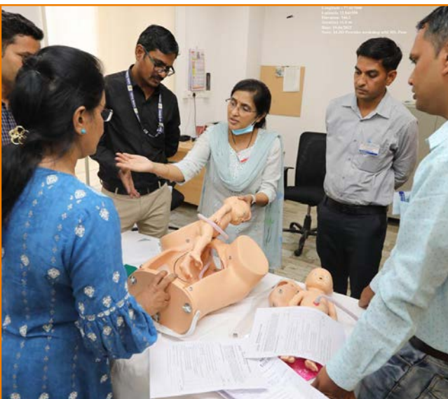
Advanced Life Support in Obstetrics (ALSO) Course of the American Academy of Family Physicians (AAFP), USA. at SCHS