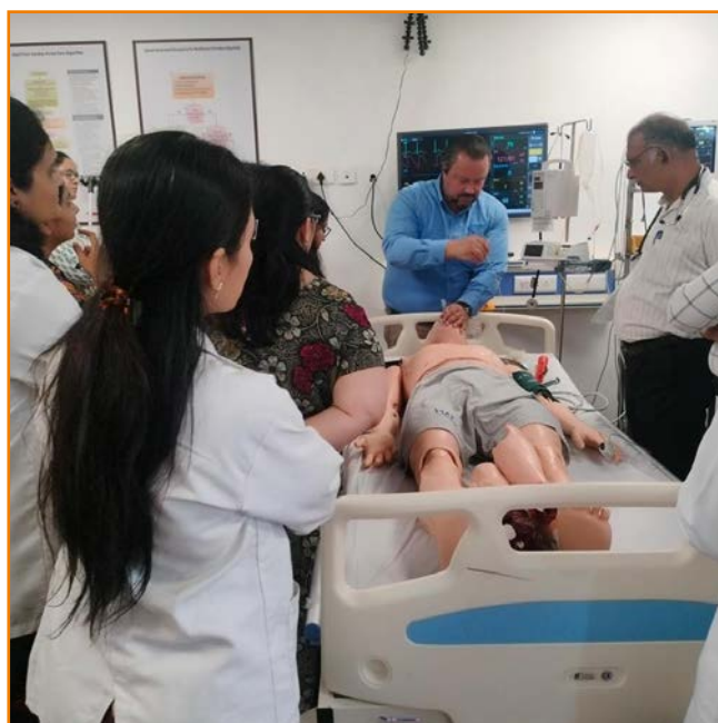
Training on Crisis Resource Management at SCHS