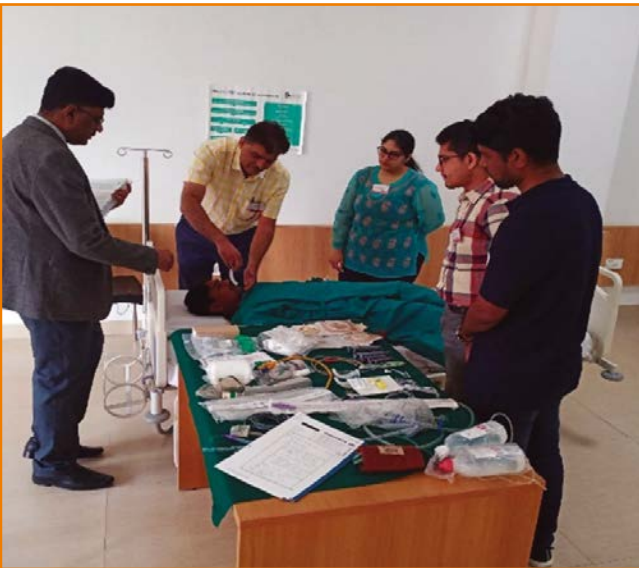
Care of The Critically Ill Surgical Patient (CCrISP) Course of The Royal College of Surgeons, England at SCHS