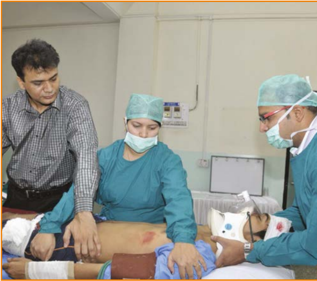
Trauma Simulation at SCHS