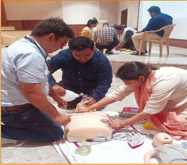
Basic Life Support (BLS) course of American Heart Association (AHA), USA training at SCHS