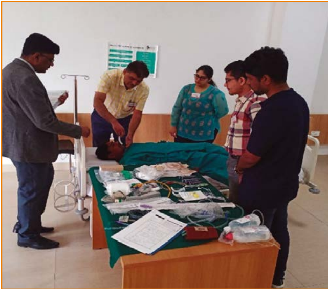
Care of The Critically Ill Surgical Patient (CCrISP) Course of The Royal College of Surgeons, England at SCHS