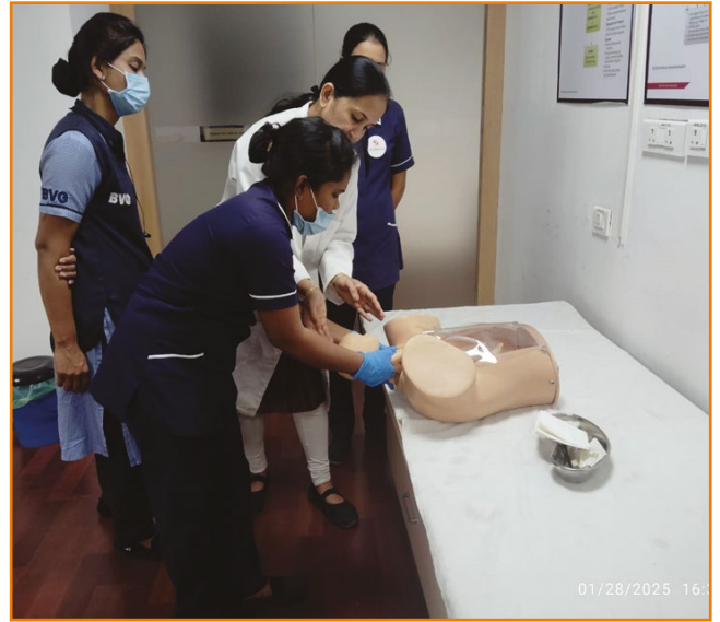
Training of Patient Care Attendants at SCHS