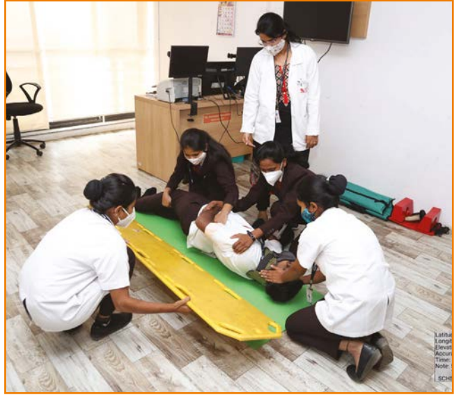
Advanced Trauma Course of International Trauma Life Support (ITLS) Organization, USA at SCHS