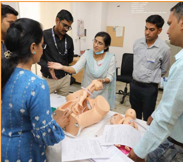
Advanced Life Support in Obstetrics (ALSO) Course of the American Academy of Family Physicians (AAFP), USA. at SCHS