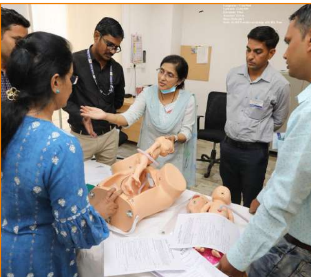
Advanced Life Support in Obstetrics (ALSO) Course of the American Academy of Family Physicians (AAFP), USA. at SCHS