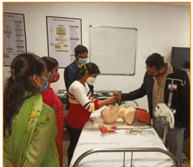
Advanced Trauma Life Support Course at SCHS