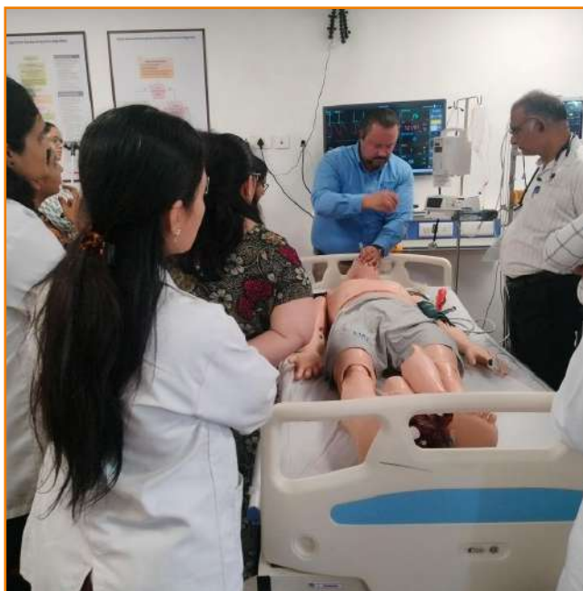
Training on Crisis Resource Management at SCHS