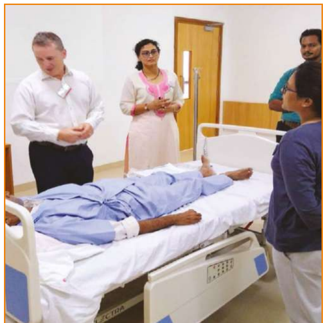
The Art of Debriefing at SCHS