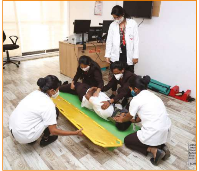
Advanced Trauma Course of International Trauma Life Support (ITLS) Organization, USA at SCHS