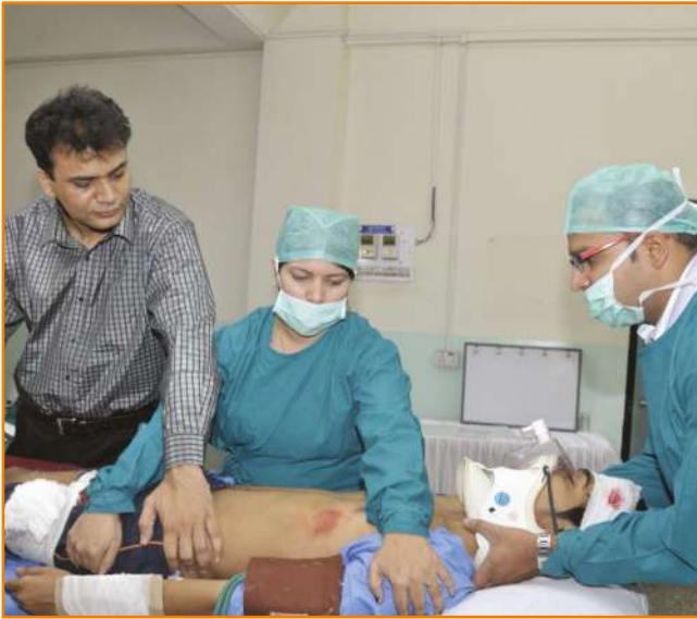
Trauma Simulation at SCHS