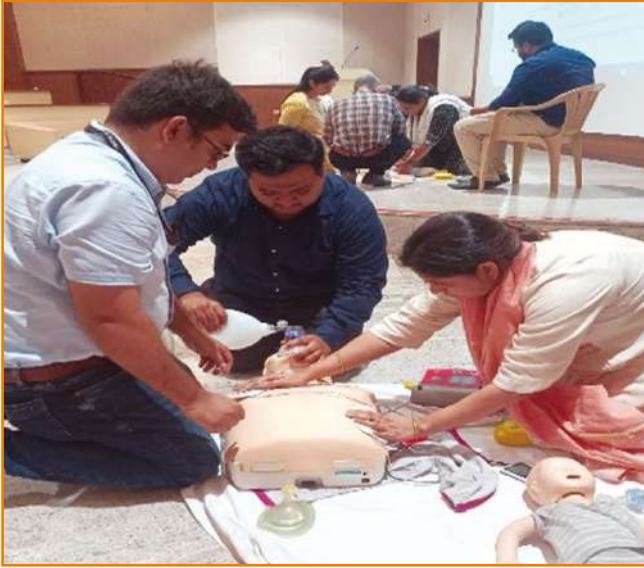
Basic Life Support (BLS) course of American Heart Association (AHA), USA training at SCHS