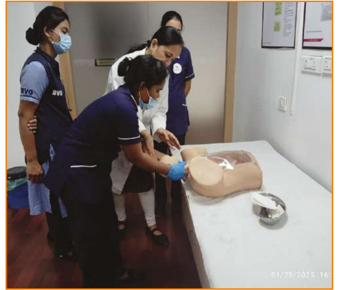
Training of Patient Care Attendants at SCHS