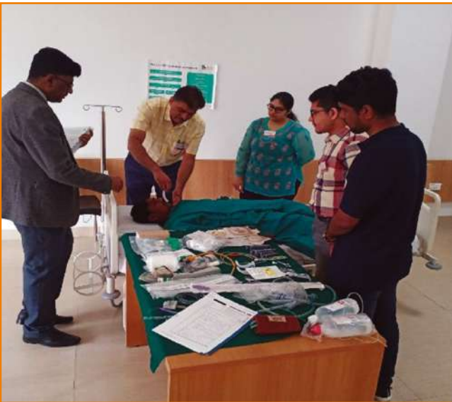
Care of The Critically Ill Surgical Patient (CCrISP) Course of The Royal College of Surgeons, England at SCHS